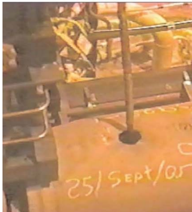
Another milestone. The first GB-filled MC-1 bomb was drained of agent at UMCDF, September 27, 2005.

A snapshot of activities from January 1 through September 30, 2005