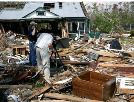
Post card from Katrina. Four Umatilla Public Information Group (UPIG) members took time out from their Hurricane Katrina response to film the October CSEPP TV spot. Standing in a debris field, they remind viewers that now is the time to make sure they have a family emergency plan and a 72-Hour Kit.