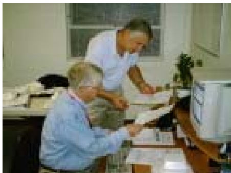
American Red Cross volunteers review shelter information and the Joint Information Center Status Board at the Pendleton Salvation Army shelter during the May 10 CSEPP Exercise.