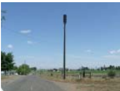
This siren located on Wyoming Avenue in Irrigon is one of six new sirens installed in the Oregon IRZ.