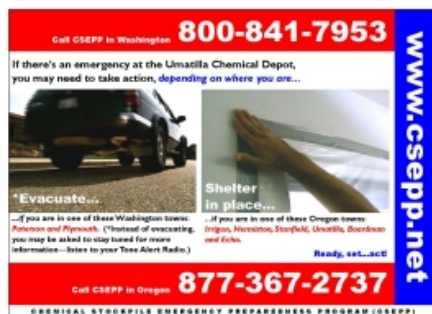
This April newspaper ad reminds residents that what they do in a Umatilla Chemical Depot emergency will depend on where they are at the time of the event.