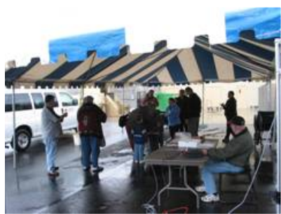
Above, mock evacuees arrive at the Wildhorse Casino Resort Reception Center during the 2005 CSEPP exercise.

Wildhorse Casino Resort, the American Red Cross, Confederated Tribes of the Umatilla Indian Reservation and Umatilla County partnered in the development of a new CSEPP reception center capability.