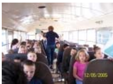
An Echo school district teacher conducts a head count as part of the evacuation drill conducted during the May 10 Annual CSEPP exercise.