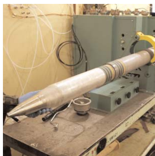
GB M55 Rocket