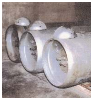
GB Ton Containers