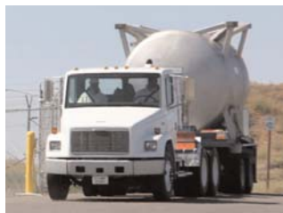
Safe, secure delivery