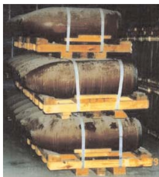
GB MC-1 Bombs